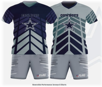
Reversible Performance Jerseys & Shorts